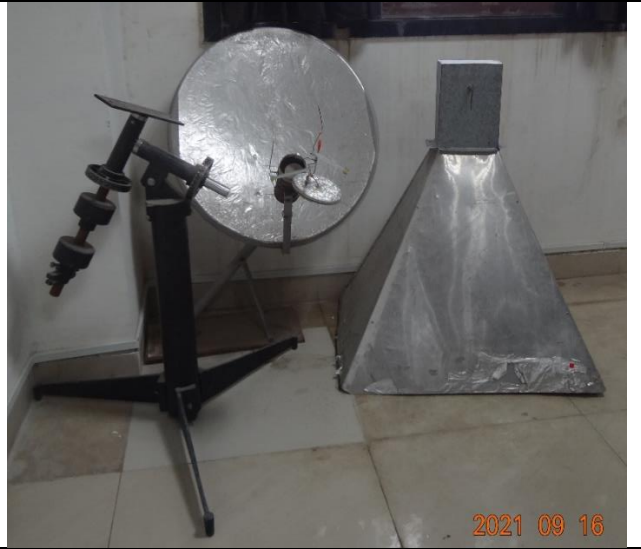
Telescopes and Antenna