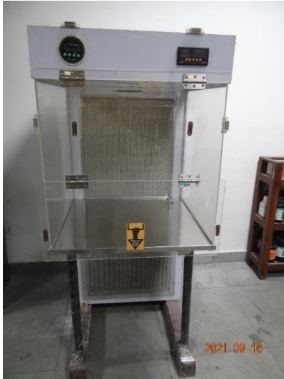
Laminar Air Flow