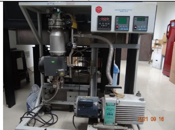
Hind High Vacuum system with Diffusion and rotary pumps