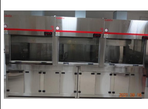
Workbench with fume hood