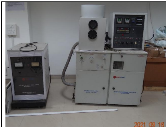
Hind High vacuum coating unit with 3 kW electron beam gun power supply