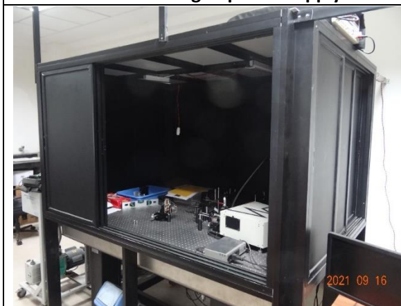
Optical Spectroscopy including Photoluminescence and UV-Vis absorption Measurements