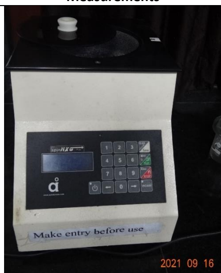
Spin Coating Systems