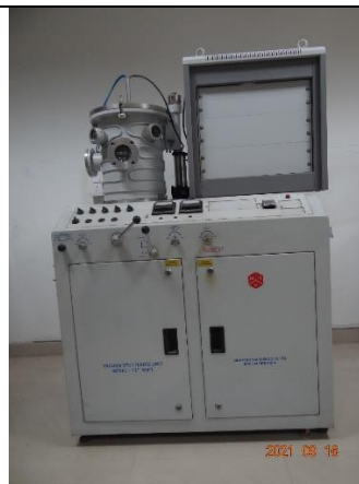
DC Magnetron Sputtering System