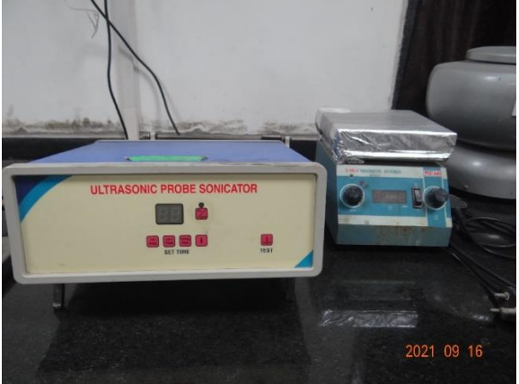
Ultrasonic probe Sonicator